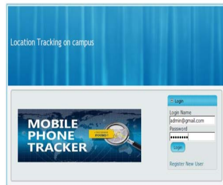
(A) Login Page